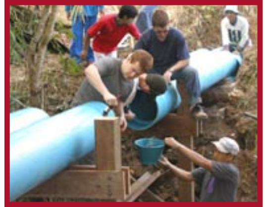
EWB-USA volunteers engineer capacity building projects in developing countries.