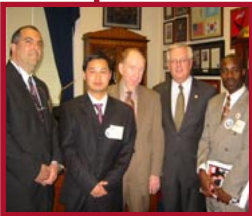
U.S. IEEE Members pose with Rep. Curt Weldon (R-Pa.), second from right, during annual Congressional Visits Day in Washington.