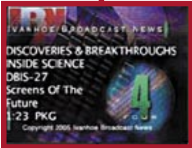
IEEE-USA is underwriting TV news spots on IEEE technologies, such as "Screens of the Future," aired on 66 U.S. television stations with a potential audience of 75-million viewers.