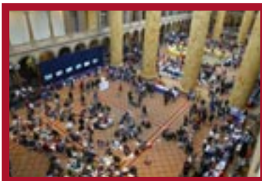
Some 6,000 youngsters and adults enjoy engineering "hands-on" and "minds-on" activities at EWeek Family Day, held annually at the National Building Museum in Washington.