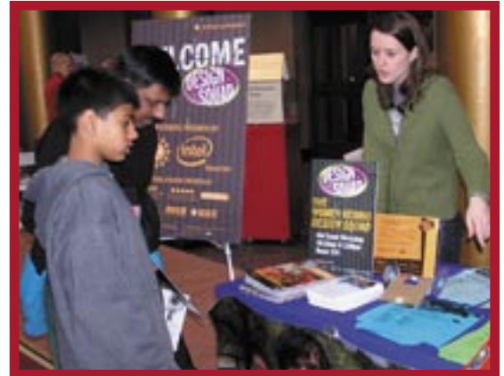
EWeek Family Day attendees review engineering challenges literature from "Design Squad" reality TV show cosponsored by the IEEE.