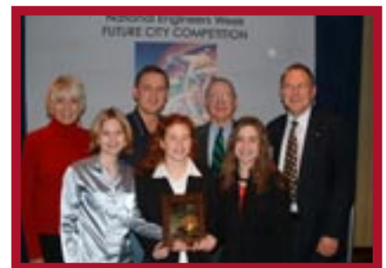
IEEE-USA launched the EWeek Future City Competition in 1993 and continues to support the competition with an annual Special Communications Award for the winning middle-school team.