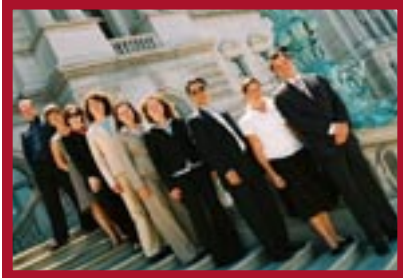
WISE participants, who research technology-policy subjects, assemble at U.S. Capitol.