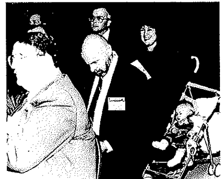
Some 200 IEEE-USA leaders and their families meet over Labor Day Weekend in Burlington, VT, at the Professional Activities Council for Engineers (PACE) Workshop. The September 1-4 workshop focused on such career-related and technology policy activities as: employment assistance, age discrimination, early retirement, pensions, U.S. technological competitiveness, computers and communications, energy, and the U.S. civilian space program.

tion. Sponsored by the Public Relations Society of America's National Capital Chapter, awards were given on June 20 for "the best public relations programs created in the Washington Metropolitan Area." IEEE-USA was honored for its role in "sending a message" to Presidential Candidates George Bush and Michael Dukakis on the importance of science and technology in a new Administration.